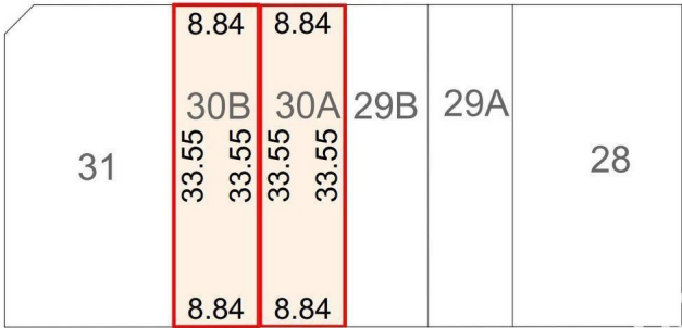
LOT DIMENSION DETAILS